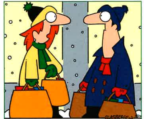
"I've got the holiday spirit — exhausted and cranky!"